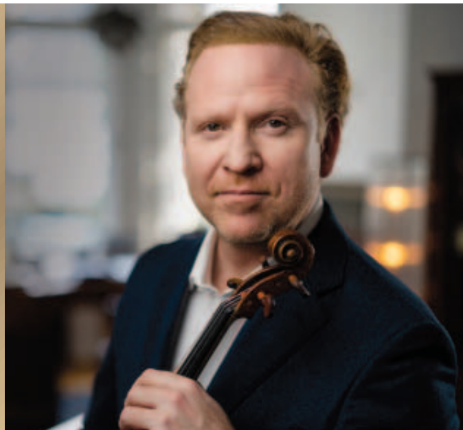
Daniel Hope, violin

5pm concert, followed by optional four-course dinner