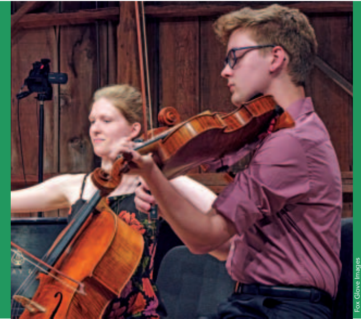
2024 Emerging Artist Fellows

Chamber music masterworks performed by the joint forces of GNPO and Emerging Artist Fellows. 3pm concert, followed by optional buffet picnic