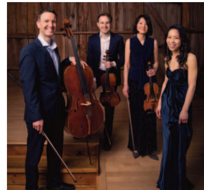
Garth Newel Piano Quartet

Garth Newel's summer season is anchored by our full-time ensemble-in-residence, whose spirited and impassioned performances have won them a loyal following here at Garth Newel and around the world. Their conversational and educational style embraces audiences with a special warmth, bringing the magic of chamber music to both Garth Newel regulars and new friends visiting us for the very first time.